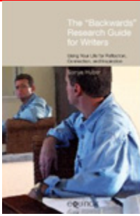
THE “BACKWARDS” RESEARCH GUIDE: Using your Life for Reflection, Connection, and Inspiration Sonya Huber Equinox Publications