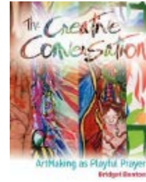
THE CREATIVE CONVERSATION: ArtMaking as Playful Prayer Bridget Benton Eyes Aflame Publishing